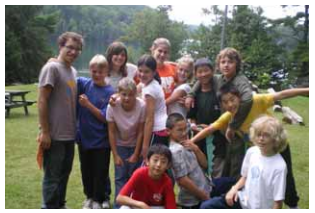
Gracefield Gracefield, Quebec