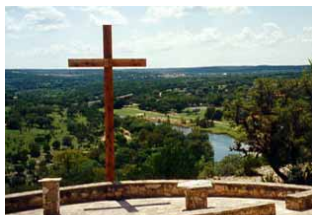
Mo-Ranch Hunt, Texas