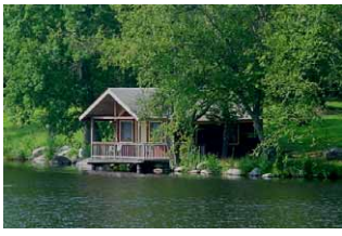
Holmes Holmes, New York