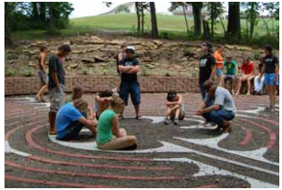
Heartland Parkville, Missouri