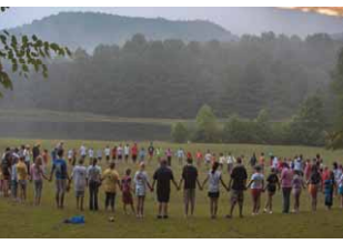
Buc Sapphire, North Carolina