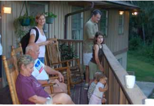
Cedarkirk Lithia, Florida