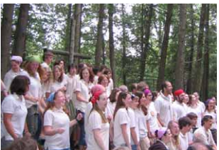
Kintail Exeter, Ontario