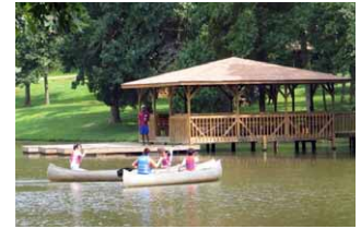
Bethelwoods York, South Carolina