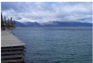
Zephyr Point Zephyr Cove, Nevada