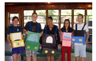
Lackawanna Tunkhannock, Pennsylvania