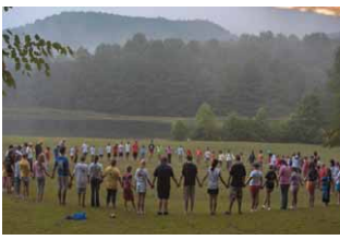
Buc Sapphire, North Carolina