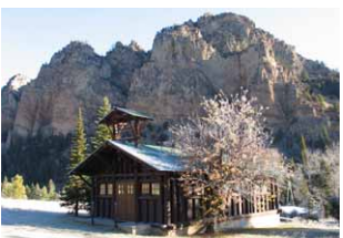
Rockhaven Gallatin Gateway, Montana