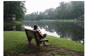
Ferncliff Little Rock, Arkansas