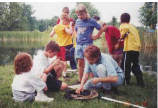
Kirkmont Zanesfield, Ohio