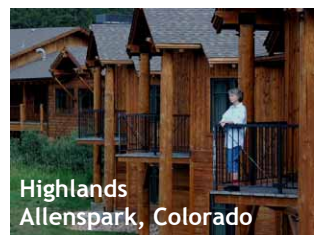
Highlands Allenspark, Colorado