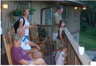
Cedarkirk Lithia, Florida