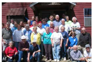
Mound Ridge Cook Station, Missouri