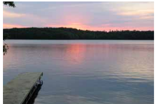
Clearwater Forest Deerwood, Minnesota