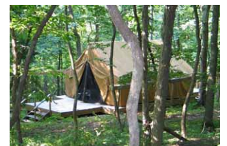
Wyoming Wyoming, Iowa