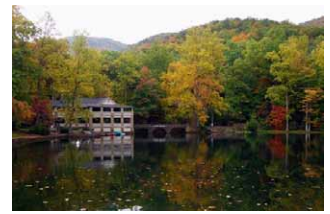
Montreat Montreat, North Carolina

A total of $200,000 will be raised for the support of the Consultants Network.