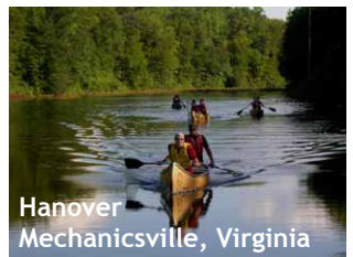
Hanover Mechanicsville, Virginia