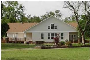
Dwight Mission Vian, Oklahoma