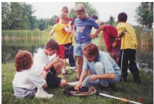
Kirkmont Zanesfield, Ohio