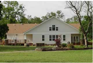
Dwight Mission Vian, Oklahoma