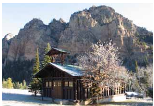
Rockhaven Gallatin Gateway, Montana