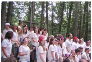
Kintail Exeter, Ontario