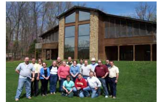
Pyoca Brownstown, Indiana