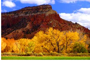
Ghost Ranch Abiquiu, New Mexico